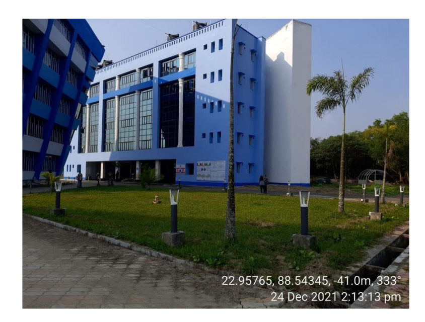
Fig. : 7.1.2.4. : Sensor-based energy conservation at MAKAUT, WB. at Haringhata Campus.

5. Use of LED bulbs/ power efficient equipment