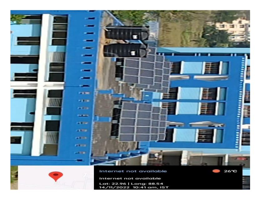
Fig. : 7.1.2.1.a. : Solar panels on Boy's Canteen rooftop.